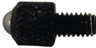
Q2125 Back Plate with Lug for Dial Indicators