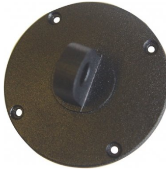
Q2125 Back Plate with Lug for Dial Indicators