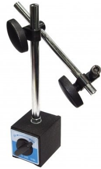
M050 Magnetic Base - Standard