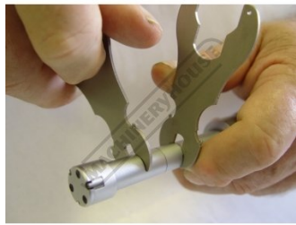
Spanners Shown In Use