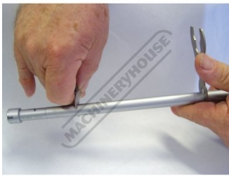
Shown Fitted with Extension Rod