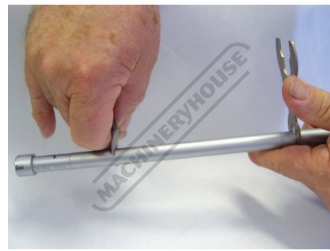
Shown Fitted with Extension Rod