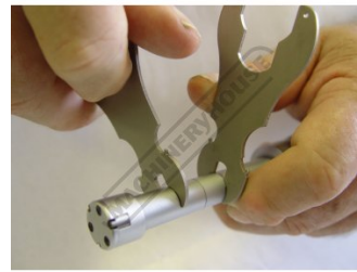
Spanners Shown In Use