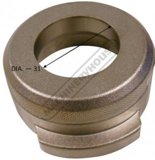
PP630A QUICK CH ADAPTOR 31mm RSAQ31