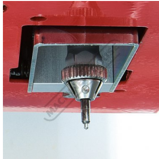
Close Up Crop