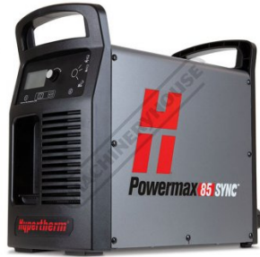
HYPER THERM Powermax85 SYNC