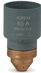
P8234 SmartSYNC™ Cartridge - 85A