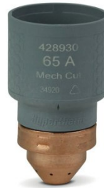
P8233 SmartSYNC™ Cartridge - 65A