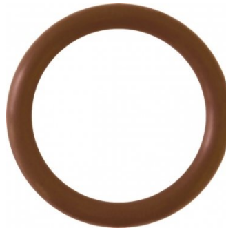
AP0021 Hypertherm O-Ring