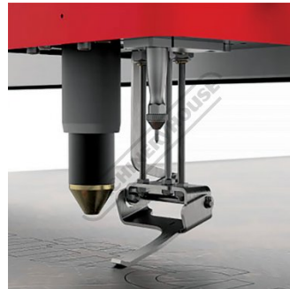
Initial Height Sense