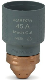
P8232 SmartSYNC™ Cartridge - 45A