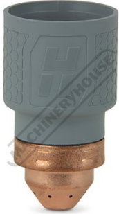
Cartridge RFID Technology