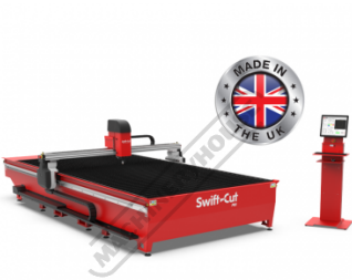
PRO 4000 Front