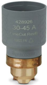
P8231 SmartSYNC™ Cartridge - FineCut©