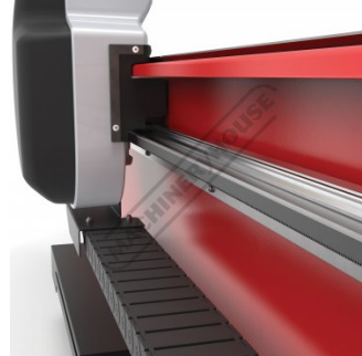
Linear Rail Rack-Side