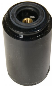
P8081 Hypertherm Eliminer Filter - Replacement filter element