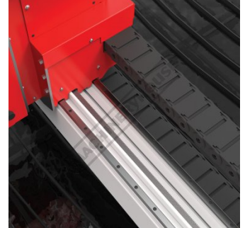
Side Rail Head