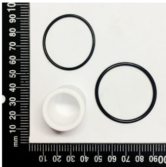
AP0001 Air filter element kit -Internal