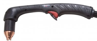
P8064 Hypertherm Hand Torch