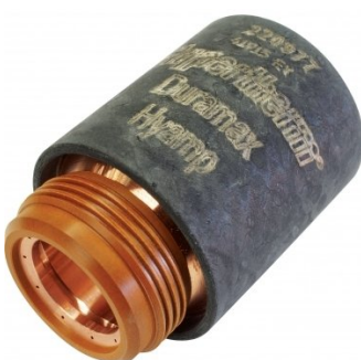
P859 Hypertherm 30-125A Retaining Cap