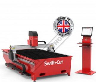
Pro 2.5m Made In UK