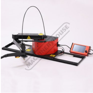
X2 System table mount (Shown with optional Arcroid CNC Robot)