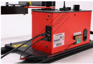
X2 Connection on Arcroid