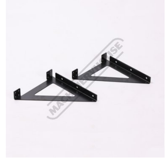
Bracket set included