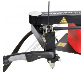
Plasma Torch Cradle