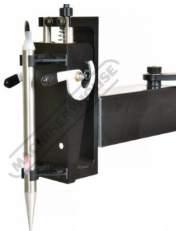
Trace Pen In Holder