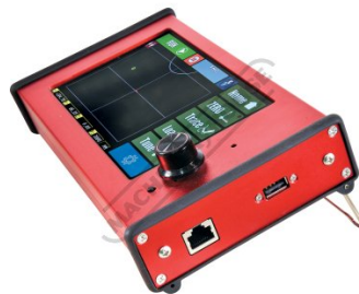
Import Via USB