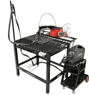
Optional Table and Plasma Torch Setup