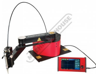
Setup With Trace Pen