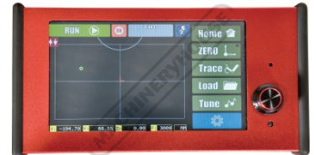
Touch Screen Interface