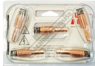
Packaging Rear View