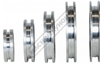
Square Formers Side View