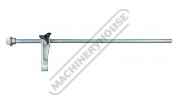
FREE - BZ-LS - Length Stop