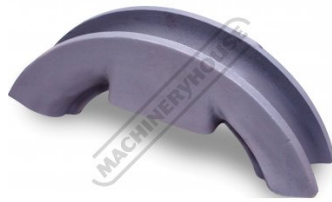
FREE - BZ-P64 - Round Pipe Former