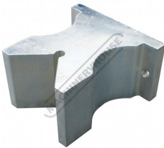
Comes with a 75mm and 105mm Former