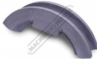
FREE - BZ-P75 - Round Pipe Former