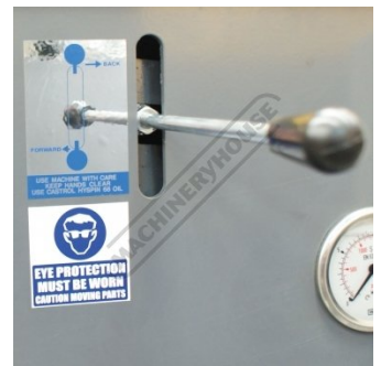
Ram Engagement Handle