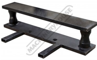
FREE - BZ-JIG2 - Pipe Bender Attachment - JIG 2