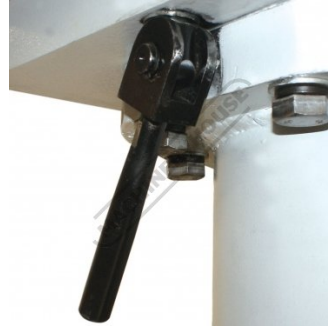
Head Locking Handle