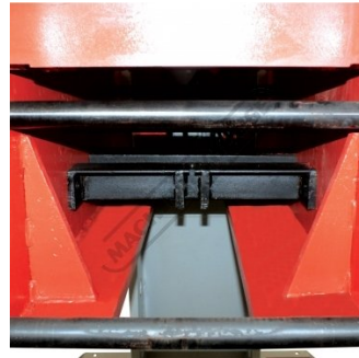
Table Height Lifting Points