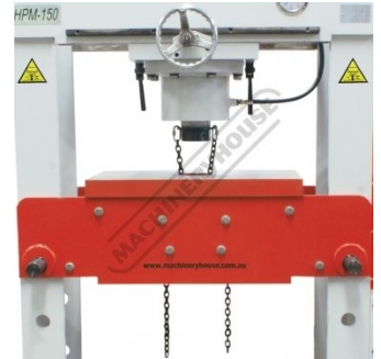
Table Height Adjustment Using Chain