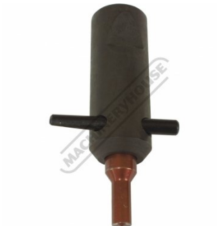
Shown with Optional Punch Inserted