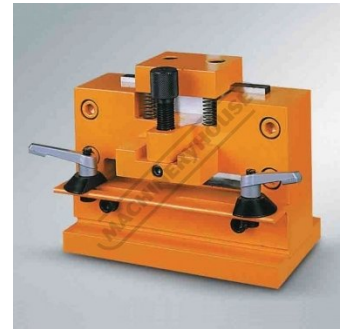
Optional Flat Bar Shearing