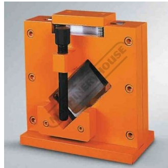
Optional Channel Shearing