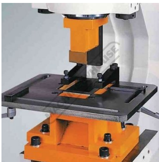
Optional Rectangular Notcher