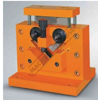
Optional Angle Shearing