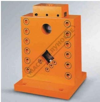
Optional Bar Shearing