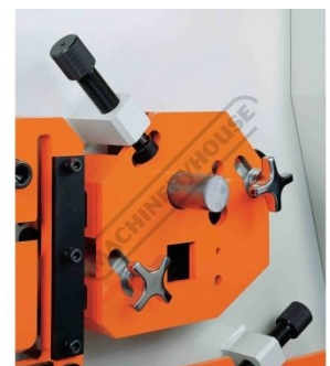
Round Bar Shear