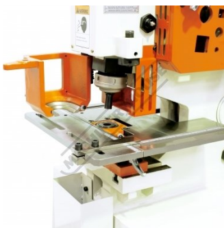
Work Table with Adj. Stops