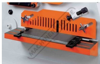
Flat Bar Shear