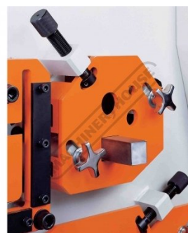
Square Bar Shear