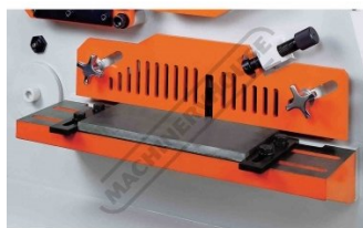
Flat Bar Shear