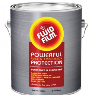
O044 Rust & Corrosion Preventive