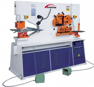
P177A Hydraulic Punch & Shear - 125 Tonne