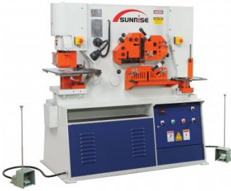
P176 Hydraulic Punch & Shear - 100 Tonne