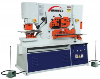
P177H Hydraulic Punch & Shear - 125 Tonne