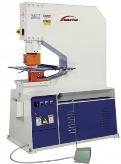
P192 Punching Machine