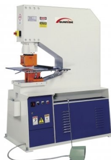
P194 Punching Machine