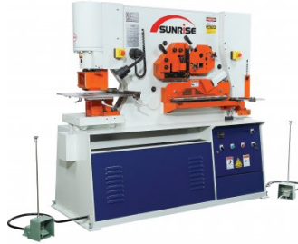
P176H Hydraulic Punch & Shear - 100 Tonne