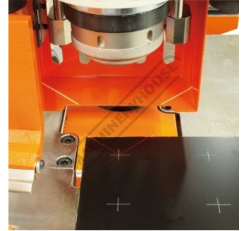
Laser Liner On Painted Steel