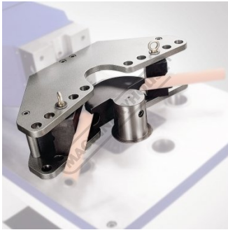
Shown with Pipe Bender Attachment