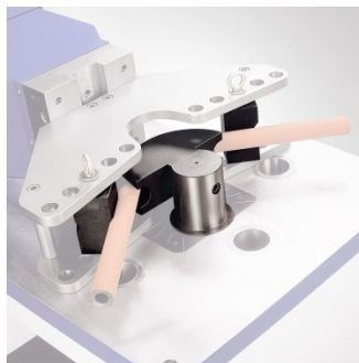
P1607 1-1/2" Pipe Bender Former Set