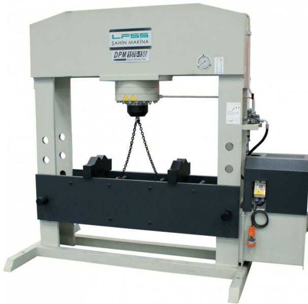
Table Pressure Gauge & Bending Vee Blocks

15hp 415V Motor, 300mm Ram Stroke & 800mm Height From Ram