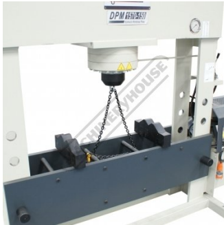
Table Height Adjustment