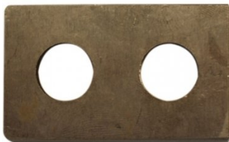
P204A Round Die - Ø4.2mm