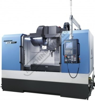
DNM 750 II Side Open