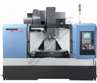
DNM650II Front Open