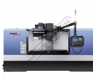
DNM750L Front Open