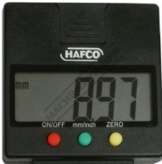
Digital Display Close Up