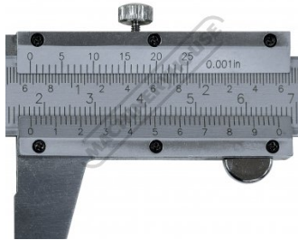
Vernier Head Lock Screw