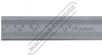
Metric & Imperial Scale