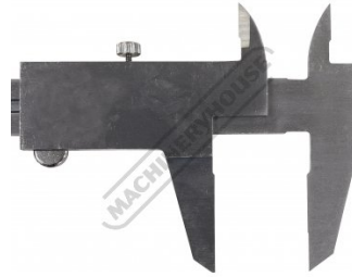
Height Measuring Slide