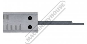
Depth Measuring Blade