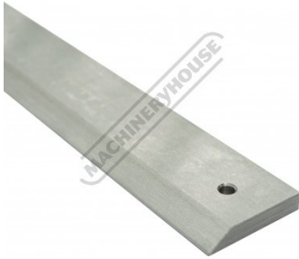
35° Bevelled Edge