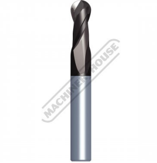
Flute Ball Nose