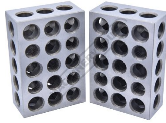
Set View 1