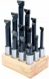
M181 Boring Bar Set - 12 piece