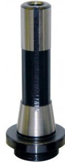
M190 Boring Head Shank