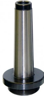
M192 Boring Head Shank