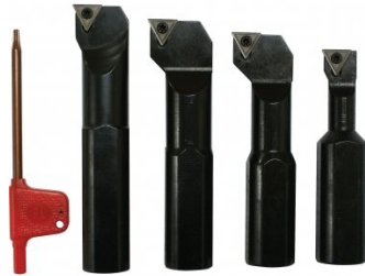
M192 Boring Head Shank