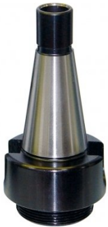
M193 Boring Head Shank