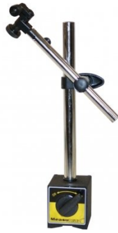
Q4351 Magnetic Base - Large