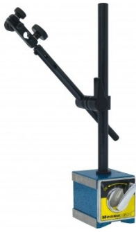
Q435 Magnetic Base - Large