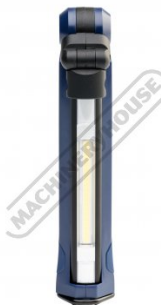
Folded Light Arm