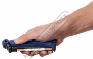
Shown Folded in Hand