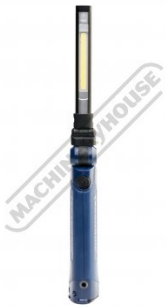
Main Light Front View