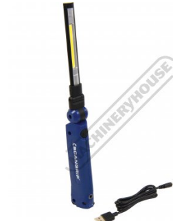
LED Light And Charger