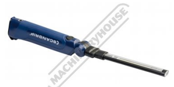
Slim Hand Light