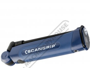
Folded Light Arm