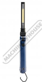
Magnetic Base & Hook Attachment