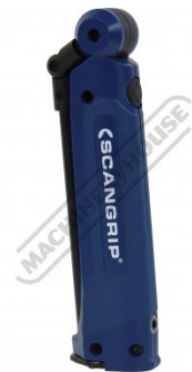
Folded Light Arm