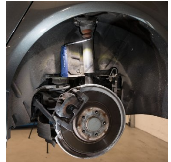
Shown in Use - Automotive Industry