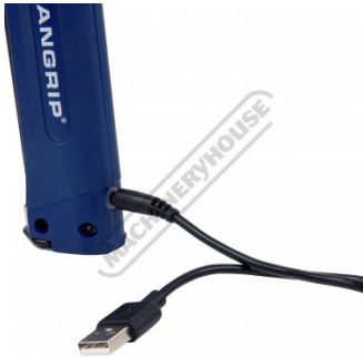
USB Charging Cable