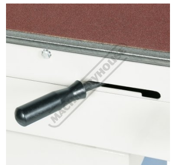
Quick Action Belt Tension Lever