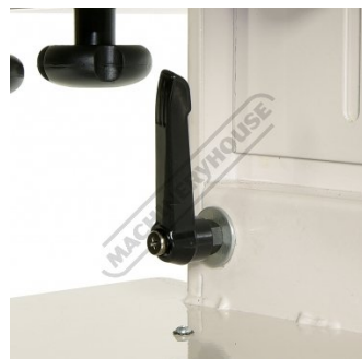
Belt Angle Tilt Lever Lock