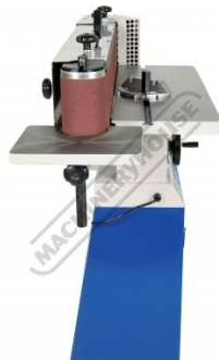
End Table View