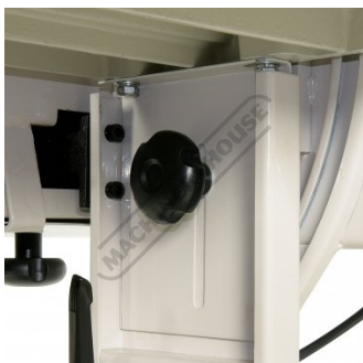
Table Height Locking Knob