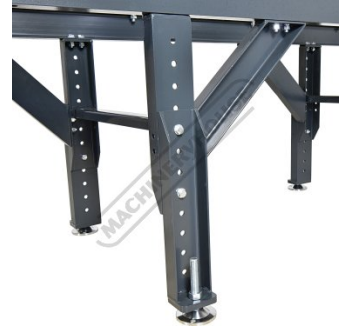
Adjustable Legs and Feet