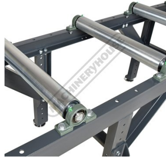
Pre drilled Holes for Extra Rollers