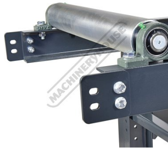
Extendable Attachment Plates