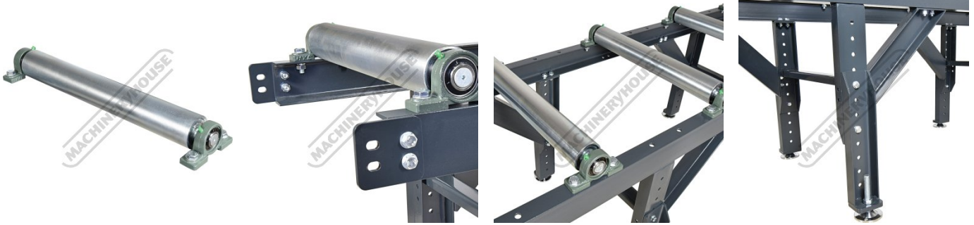
600mm Heavy Duty Ball Bearing Rollers with Grease Nipples