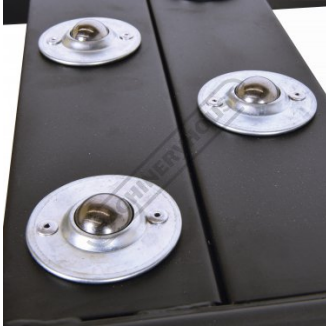
Steel Transfer Balls