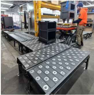
Assembly Line process