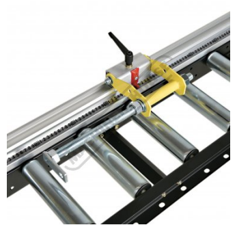
Shown In Stop Position