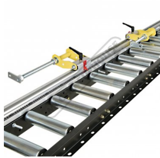
Shown With Optional Length Stop