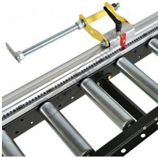
Shown In Open Position