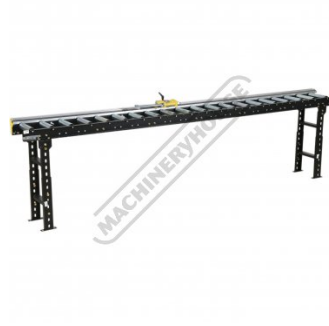
Shown With Optional Roller Conveyor