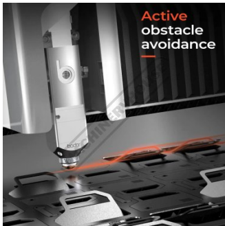
Active obstacle avoidance