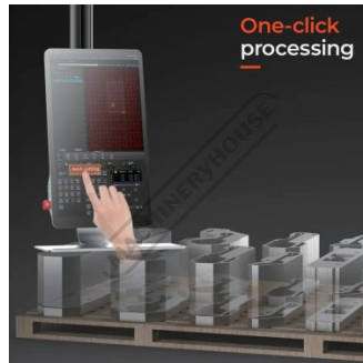
One click processing