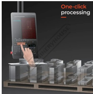
One click processing