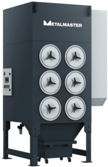
W2724 Laser Fume Extraction