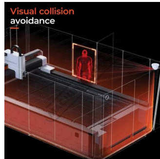
Visual collision avoidance