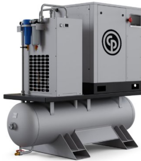
C5401 High Pressure Rotary Screw Compressor for Fiber Laser Cutting