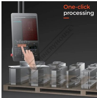
One click processing