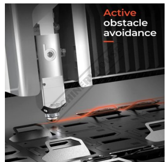
Active obstacle avoidance