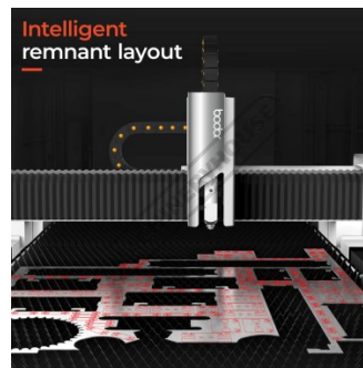
Intelligent remnant layout