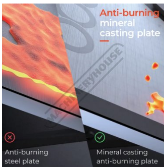
Anti burning mineral casting plate