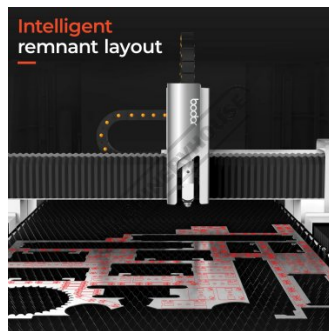
Intelligent remnant layout