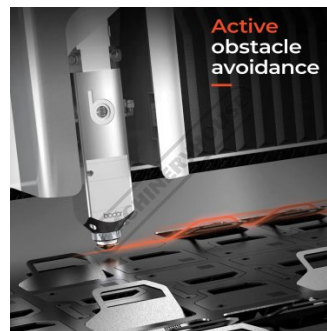
Active obstacle avoidance