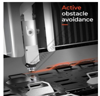
Active obstacle avoidance