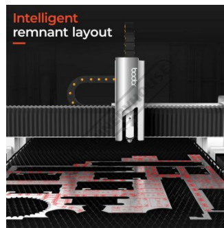
Intelligent remnant layout