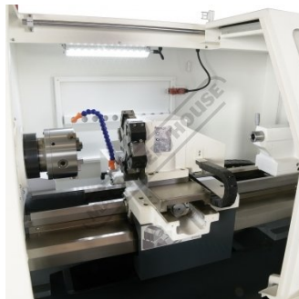
Front View of Chuck and Tool Changer