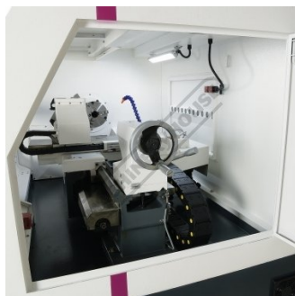
Side View Inside