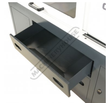
Pull Out Swarf Drawer