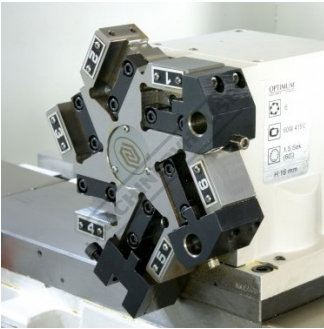
6 Station Tool Changer