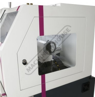
Side Access Door