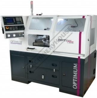
Right View With Swivel Controller