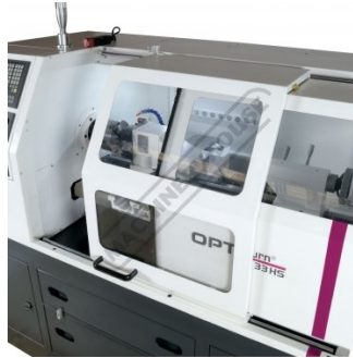
Sliding Front Door