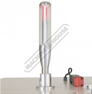
Machine Status Light