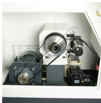
Spindle Drive System