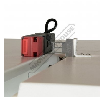
Safety Interlock For Front Sliding Door