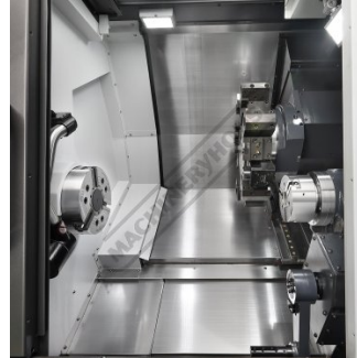
LYNX 2600SY Inside