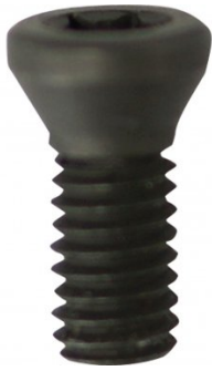
L539A Screw to Suit Threading Tool Holders