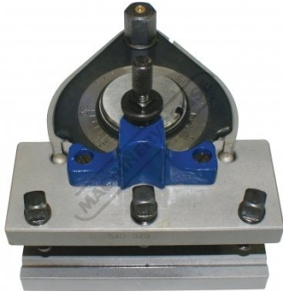
Quick Change Toolpost