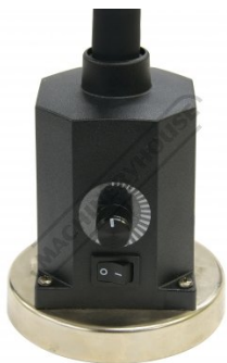
Brightness Dimmer Control