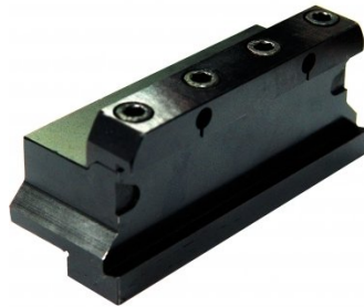
L029B Parting Block - Suits 32mm Blade