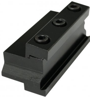
L029 Parting Block - Suits 26mm Blade