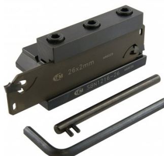
L465 Professional Lathe Parting Tool Kit - Insert Type